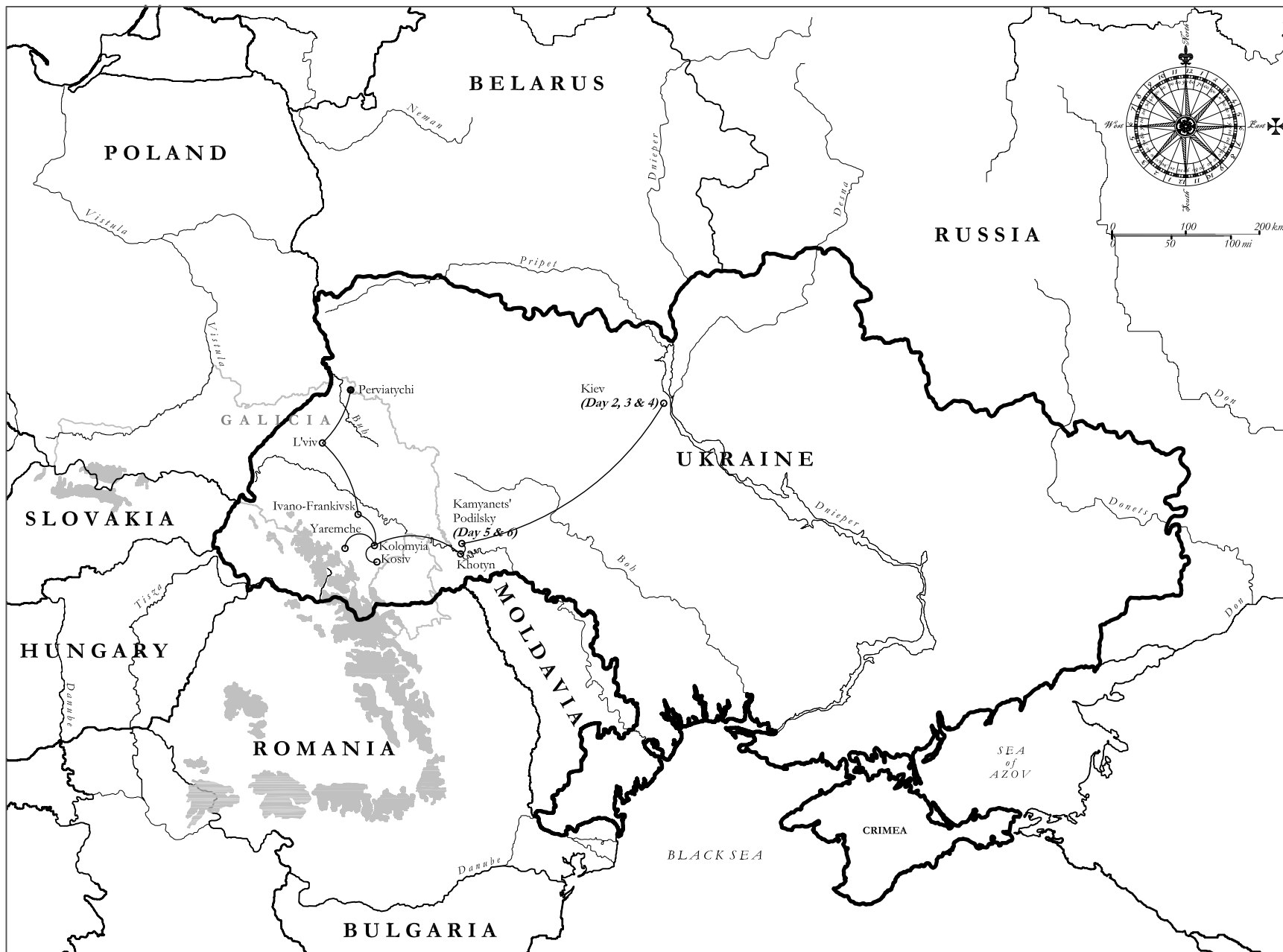
Map 1 2011 Maksymetz Family Reunion - Trip to Ukraine